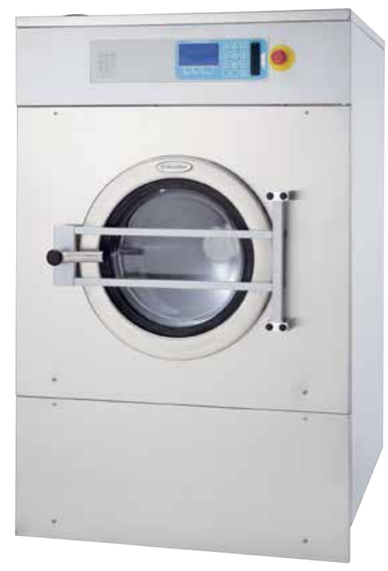
Images shown are a representation of the product only and variations may occur.